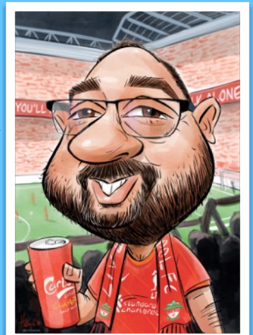
HEAD & SHOULDERS WITH DETAILED BACKGROUND/ HOBBY