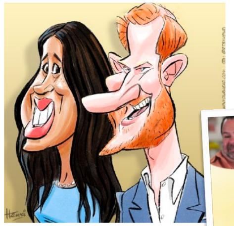
HEAD & SHOULDERS NO BACKGROUND (BASE CARICATURE)

THE FACE YOU'VE ALWAYS WANTED, BUT WERE AFRAID TO GET!