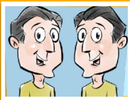
3/4 ANGLE LEFT/RIGHT