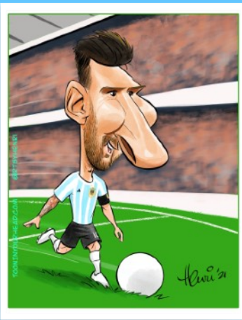
FULL BODY & BACKGROUND