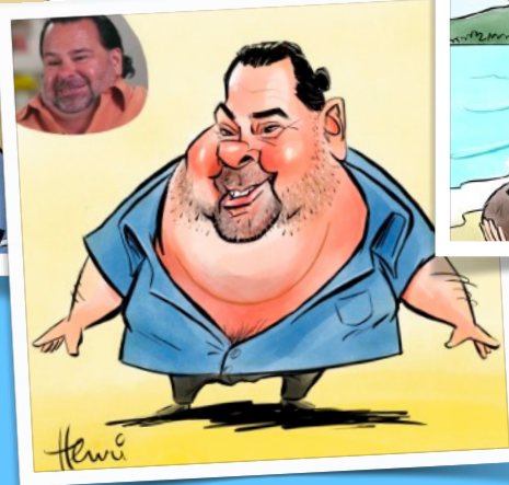
FULL BODY NO BACKGROUND